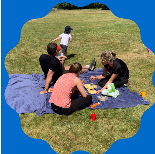
Enjoying a summer picnic and games in aid of Tynedale Hospice at Home