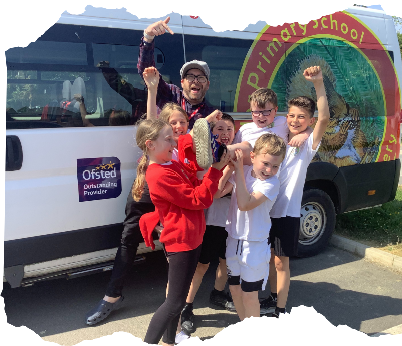
Class 2 celebrate winning at the dodgeball festival in May.

This is all part of our commitment to keeping our children fit and healthy, as well as promoting our partnership with other schools.