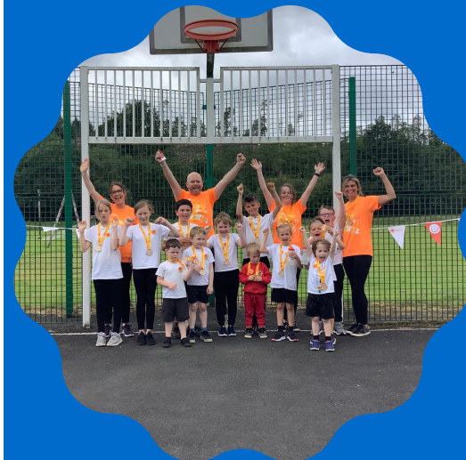
Celebrating some amazing performances in our sponsored Cancer Run

Well done and thank you so much to those who support our children in raising money for these all-important causes.