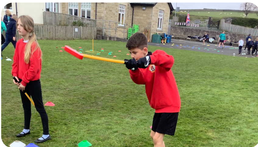
Our pupils enjoying some golf at Greenhaugh Primary School